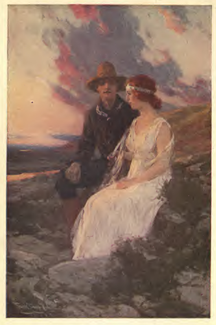
I COULD NOT SPEAK THEN, FOR ONE SENTENCE WAS RINGING IN MY EARS—"I WAS ALWAYS THINKING OF YOU"